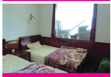
One of the 8 guest rooms