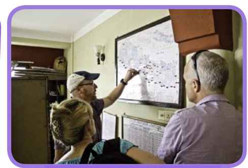
Reviewing current locations