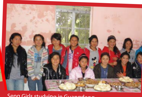
Seng Girls studying in Guangdong.