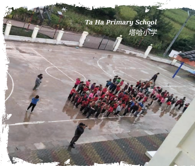
Ta Ha Primary School 塔哈小学